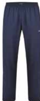
tracksuit bottoms style 1