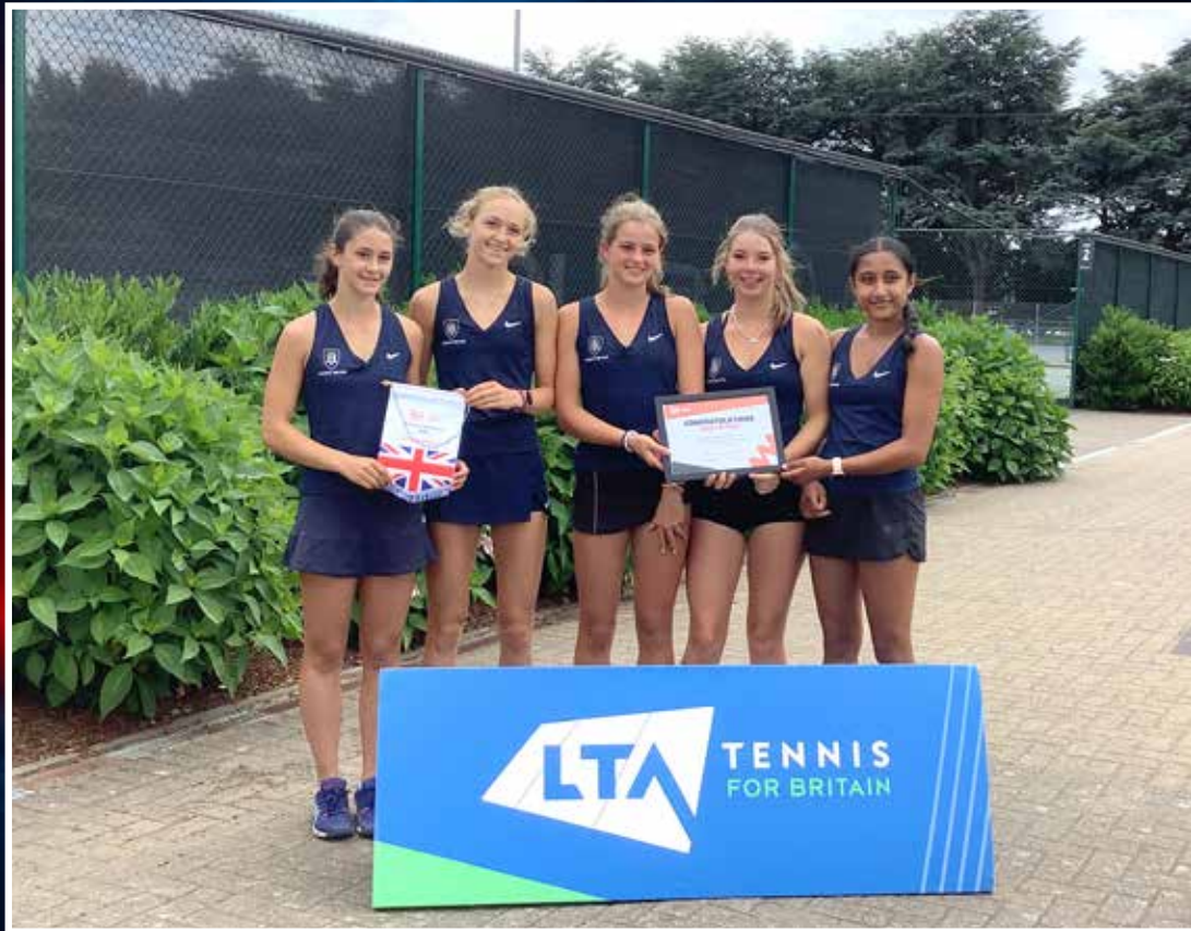
6th Place Aberdare Cup 2024