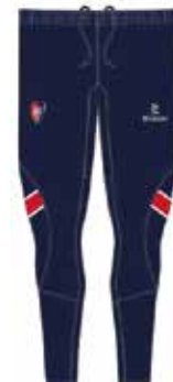
tracksuit bottoms style 2