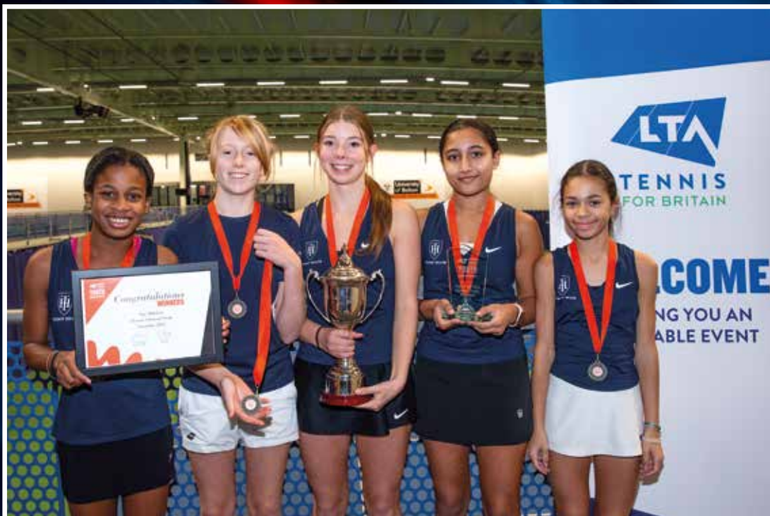
National Champions 2023 Year 7/8